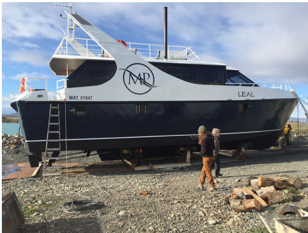
Figure 2 - M/V Leal on dry dock for State Inspection upon arrival of the science team in Puerto Bandera.