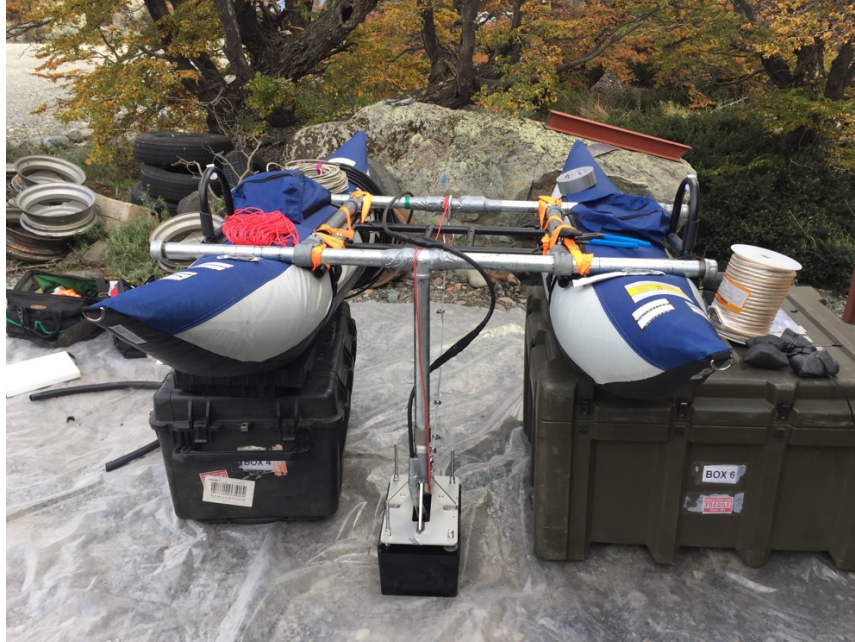
Figure 3- Assembled pontoon and pole mount CHIRP transducer. The pontoon was towed behind the M/V Leal and co-located with a GPS antenna.