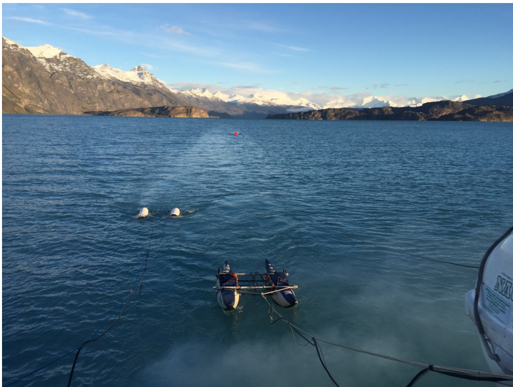
Figure 4 - View of the seismic acquisition system from the stern of the M/V Leal. The boomer is mounted on a catamaran with buoys (to the left). The end of the streamer is marked by the red tail buoy. The pontoon tows the pole mount CHIRP transducer. Layout of the configuration are shown in Figure 5. In the background is Boca del Diablo, the entrance to the glacial valleys.